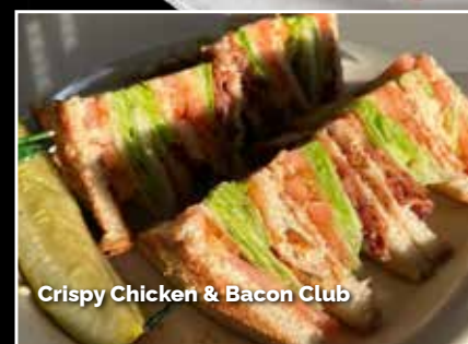
Crispy Chicken & Bacon Club