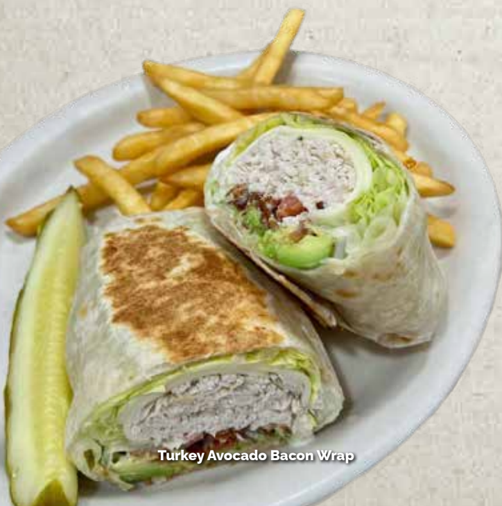
Turkey Avocado Bacon Wrap