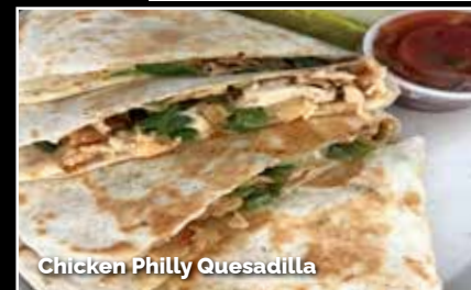
Chicken Philly Quesadilla