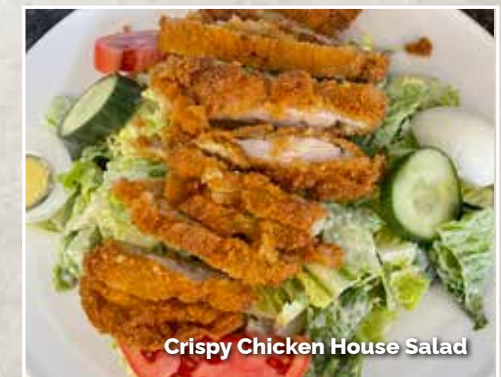
Crispy Chicken House Salad