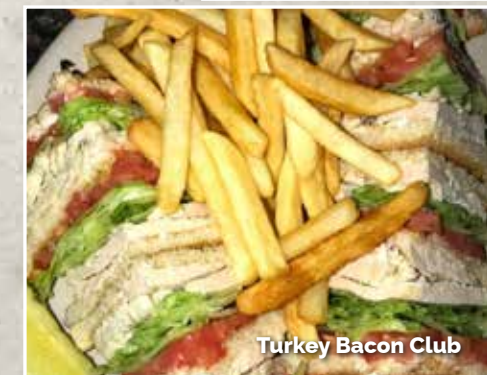
Turkey Bacon Club