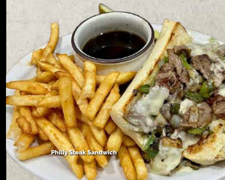
Philly Steak Sandwich